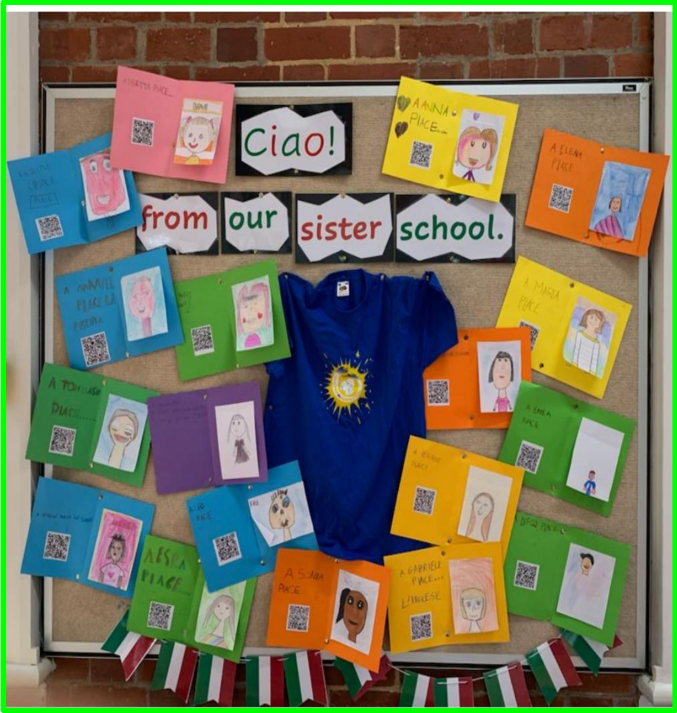
From Coburg West Primary School Italian students to our Sister School Don Milani Elementare