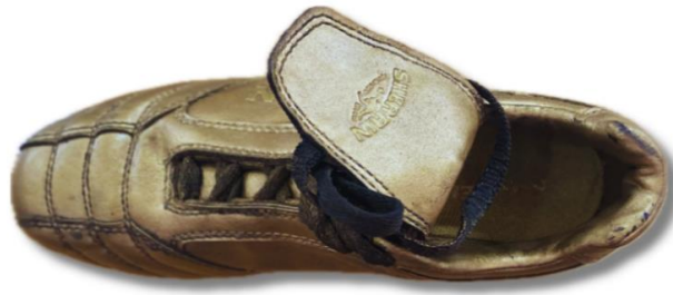
Shore reserve showdown – golden boot 2023 Coburg West Warriors

A year in review from the school council president