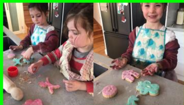
Aurora J Foundation L