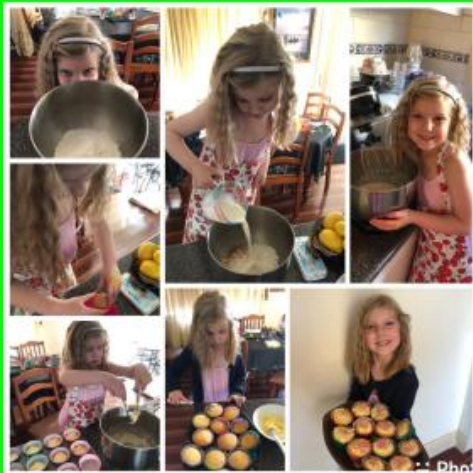
Selena T Foundation Y