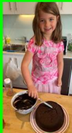
Anouk D Foundation L